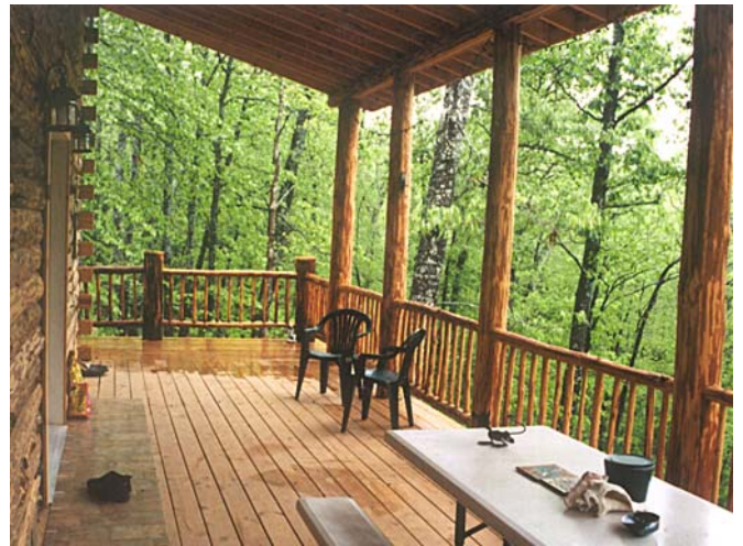
Upper Level Porch - Huge porch with gas grill and picnic table.