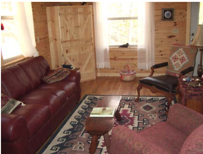
Living Room - Warm hearted and comfortable.