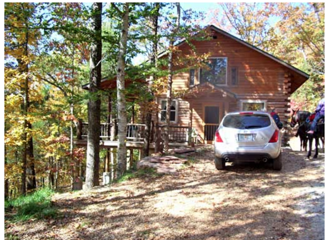
Front Entrance - View of cabin from driveway.