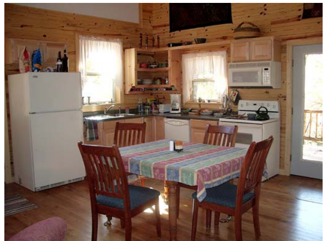
Kitchen - Fully equipped. Table has extra leaf.