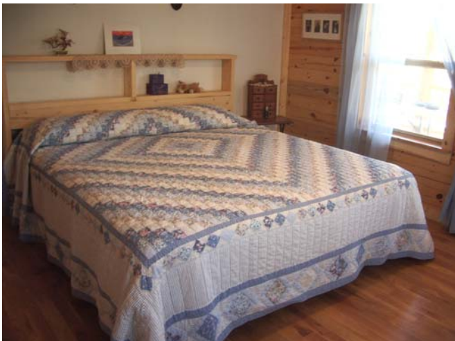
Master Bedroom - Has king size bed.