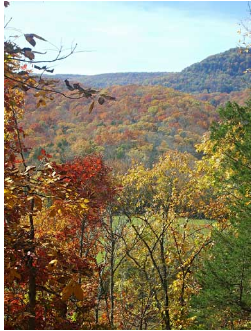
Beautiful Views - View of Murray Valley from property.