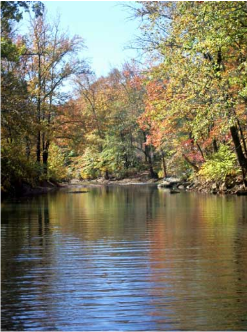
Little Buffalo River - Ten minute walk from house.