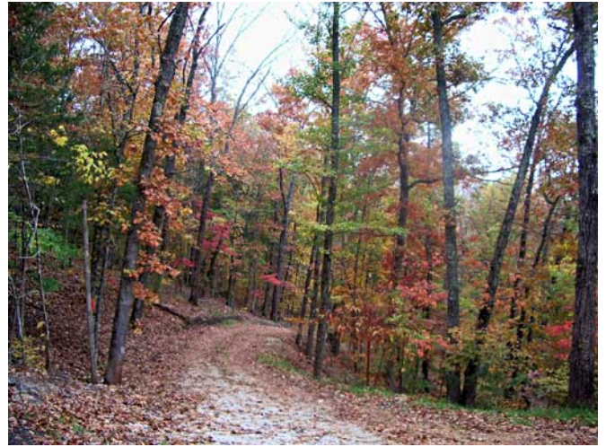
Secluded Driveway - Lovely fall colors.