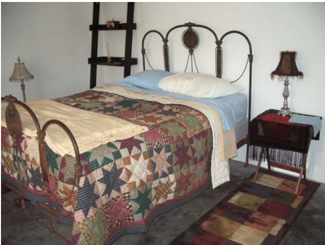
Lower Level Bedroom - Has full size bed and picture window.