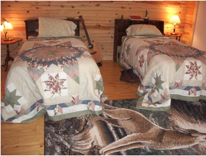
Upstairs Bedroom - Has comfy twin beds with full bathroom.